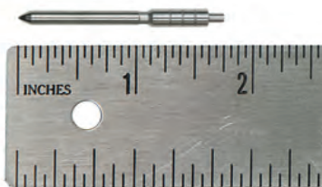
High-Pressure Common-Rail (HPCR) Fuel Injector Pintal

Unlike all-in-one diesel fuel additives that may sacrifice performance in specific areas in the name of convenience, AMSOIL diesel fuel additives make no sacrifices; as performance concentrates, they deliver maximum results in specific areas, representing an alternative to less effective all-in-one additives. AMSOIL diesel fuel additives are recommended for all types of on- and off-road, light- and heavy-duty and marine diesel engines. New packaging and product names better align each additive to its intended purpose.