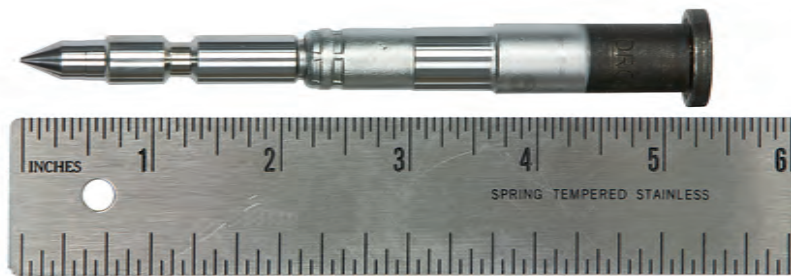
Traditional Fuel Injector Pintal

Fuel injectors in high-pressure common-rail diesel engines use smaller, highly engineered components to produce the higher fuel pressures needed for improved combustion. The tighter clearances invite internal diesel injector deposits that interfere with injector-needle actuation, reducing performance. External deposits can also form on the injector nozzle (the typical trouble spot for traditional injectors). While other fuel additives have yet to catch up to the internal diesel injector deposit problem, AMSOIL Diesel Injector Clean and Diesel Injector Clean + Cold Flow target deposits wherever they form, maximizing power, fuel economy and performance in high-pressure common-rail and traditional diesel engines.